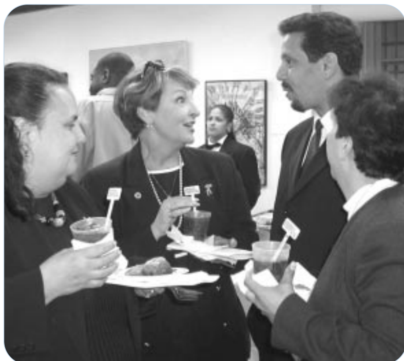
Guests at Appreciation Day

On Friday, April 5th the Centro celebrated its second Appreciation Day at the Centro Cultural Julia de Burgos. About 200 people gathered at the Centro Cultural Julia de Burgos, the premier arts and cultural center in Spanish Harlem, to enjoy the night's program, the food from La Fonda Boricua and the music from Yerba Buena.